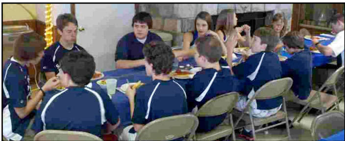
The Race Team scarfs down a meal before they go to work at the SJRT fundraiser.

Contact VC Sjoerd VanderHorst at 440-617-9995 or sjvanderhorst@gmail.com if interested.