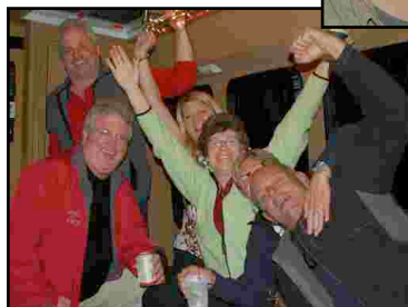
Vermilion members came in by the bus load.