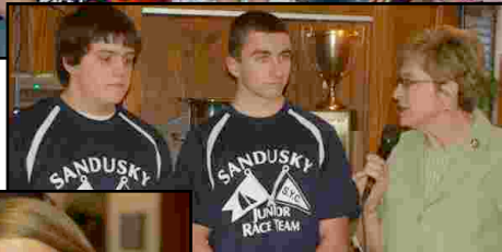
State Rep. Marcy Kaptur talked to the group about the importance of youth programs.