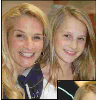
Mom, daughter and friends.