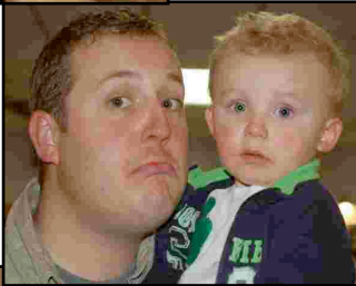
Future Race Team member.